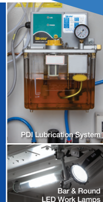
PDI Lubrication System

Box Way Construction Spindle Oil Cooler 3 LED Work Lamps (2 Bar/1 Round) Fully Enclosed Spindle Air Blast Automatic PDI Lubrication System Operation Indication Lamp Rigid Tapping Chip Flush System 3-Way Chip Augers High Torque (22.5hp peak) Remote MPG