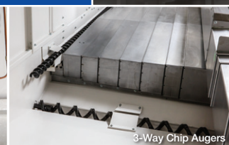
3-Way Chip Augers