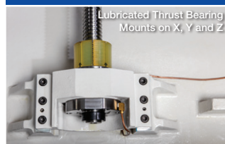
Lubricated Thrust Bearing Mounts on X, Y and Z